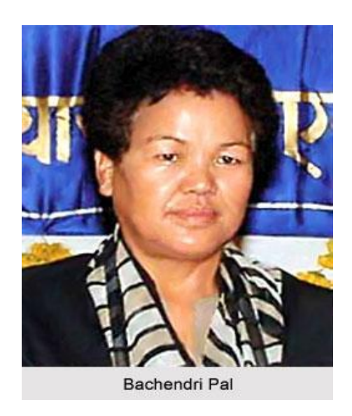
1. Bachendri Pal - First Indian woman to reach the Mount Everest summit

Smt. Bachendri Pal is the first Indian legendary woman mountaineer who reached the Mount Everest summit in 1984. She had her name listed in the Guinness Book of World Records for her achievement by 1990. The expedition had 6 women and 11 men and she was the only woman in her group to continue the climb and reached the summit on May 23 1984 at 1:07 pm. Thereafter, she headed several expeditions in 1993, 1994 and 1997 with a team comprising of all-women namely Indo-Nepalese Women's Mount Everest Expedition, The Great Indian Women's Rafting Voyage and First Indian Women Trans-Himalayan Expedition. She has been conferred with the Padma Shri in 1984 and has also been awarded the National Adventure Award by the Government of India in 1994.